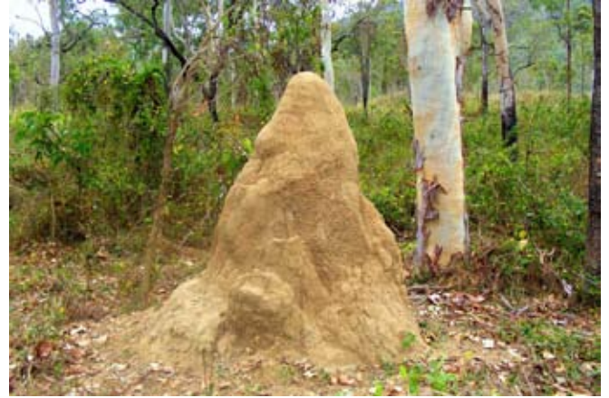
Figure 6. Coptotermes acinaciformis constructs a mound north of the Tropic of Capricorn.