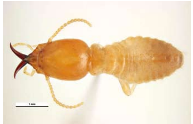
Figure 1. The subterranean termite Coptotermes acinaciformis . (Illustration courtesy of www.padil.gov.au ).

Termites are social insects, working and living together in groups (colonies). Each colony contains several types (castes) which differ in body shape and behaviour, and each caste is specialised to perform different tasks. Three principal castes are recognised: workers, soldiers and reproductives (the primary king and queen and sometimes supplementary reproductives).