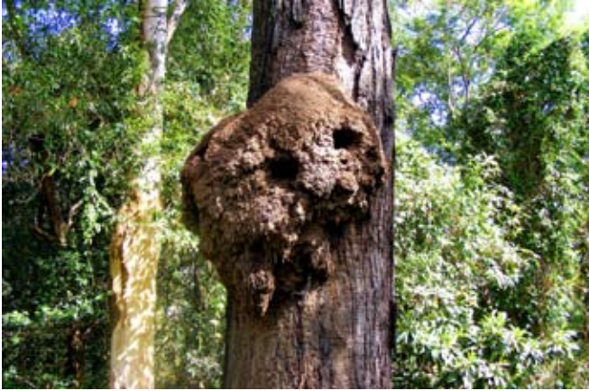
Figure 4. Arboreal nest of Microcerotermes sp.