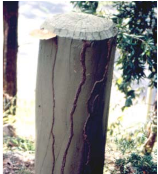
Figure 7. Microcerotermes sp. attacking painted timber decayed by the fungus Pycnopus coccineus .

Cellulose is digested by intestinal protozoa in many species of termites, or by bacteria in species in the family Termitidae. The plant tissues upon which termites feed contain very little protein and therefore little nitrogen. However, the protozoa and bacteria do contain nitrogen, and often termites dispose of excess, dead and diseased members of the colony by cannibalism, thereby conserving nitrogen. Some termites are capable of fixing atmospheric nitrogen using gut bacteria.