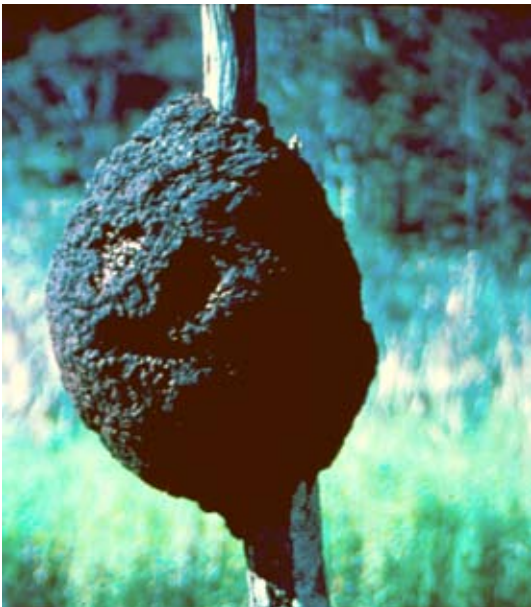
Figure 5. Arboreal nest of Nasutitermes sp.